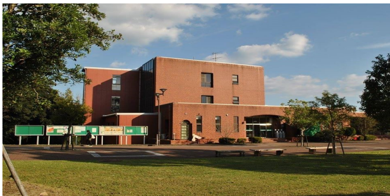
The CIR office is on the 2nd floor of University Hall (above the cafeteria).